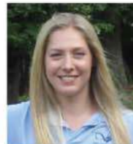
Nina blogging live Sept. 24-Oct. 2 from the games.